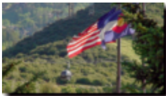
The Riverfront Express is a reality.

This project has been made possible by the resources of the new Westin Resort, pictured at right under construction. It will require an investment of $500 million and will cover 19 acres to become the Riverfront