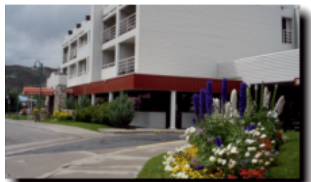
Our Lodge is well-known for its beautiful flower presentations.