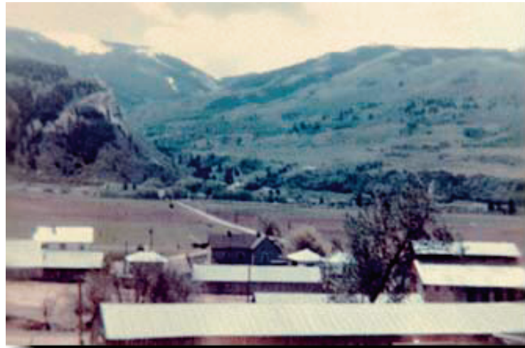
This picture reflects what the town of Avon looked like in 1950, just the old Nottingham farm. You can see the bald spot that is above Beaver Creek Ski area presently, along with the cliffs that are still visible nowadays on the left.