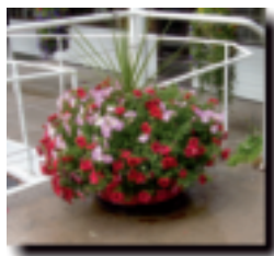
The planters showcase the Grounds crew's talents

Once we have a theme the homework begins to bring it to the final desired look. Flower research can be tricky in a microclimate like that in which the Lodge is located. Our plants must endure extreme temperature changes, severe storms, a periodic heavy rain or hail storm, bright sunshine and even an occasional late-season snowfall. Sometimes several of these conditions