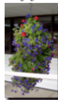
Hanging baskets show great pride!

arrive by Memorial Day weekend for our guests to enjoy and can be protected from freezes with protective covering bags.