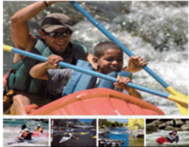
Summer or Winter? Thanks to the Avon Whitewater Park summers in Avon are even more fun.

The Avon Whitewater Park includes: a new boat ramp, a spectator terrace, wetlands planning, kayaking clinics